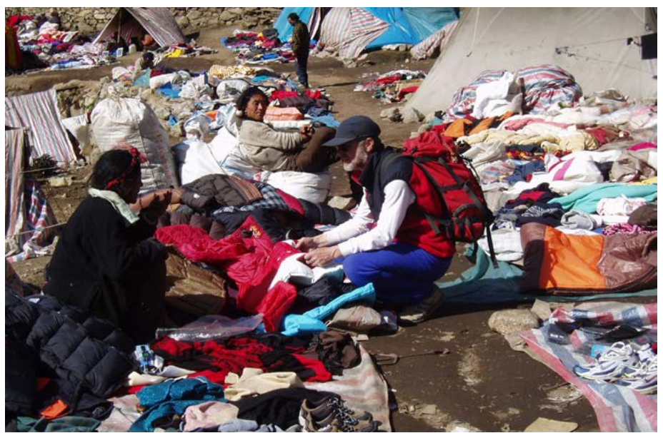
The author chatting with Tibetan traders in 2008

Whilst working in the northern border areas for over a year, I came across many ailing refugees who had, at considerable risk trudged through ice, rocks and snow on bleeding feet and frostbitten extremities to exhaustedly cross the high altitudes to assumed safety. They were lucky; some of their compatriots were arrested and deported by the Nepali military. Others managed to keep travelling to Kathmandu or eventually to Tibetan communities in India. Some recalled fellow refugee aspirants being shot by Chinese border guards. Seeking freedom has costs: leaving families; enduring possible topographic and physical harm en route, as people have little choice but to cross high passes through which altitude and snow conditions can rapidly debilitate them; separating from cherished personal effects; heading into an uncertain future; relentless eternal longing for one's homeland.