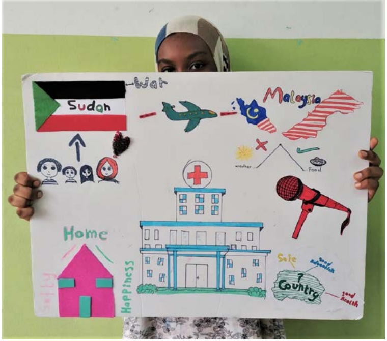
Participant in the Youth Migration Project.

probing questions and empathic reflections have yielded deeply revealing and nuanced accounts of their experience than the visual production itself. In the SBN process, youth generally do not restrict their narrative to explaining the images on their Story Board; as they explain one part of their board, their narrative often deepens to include background information, thoughts, feelings, and other associations. In the traditions of arts-based research and mixed methods research, central use of the SBN data aims to create new knowledge about forced migration in the intersubjective space where meaning making is co-produced by the narrator, their peers, and a facilitator who is also a migrant.