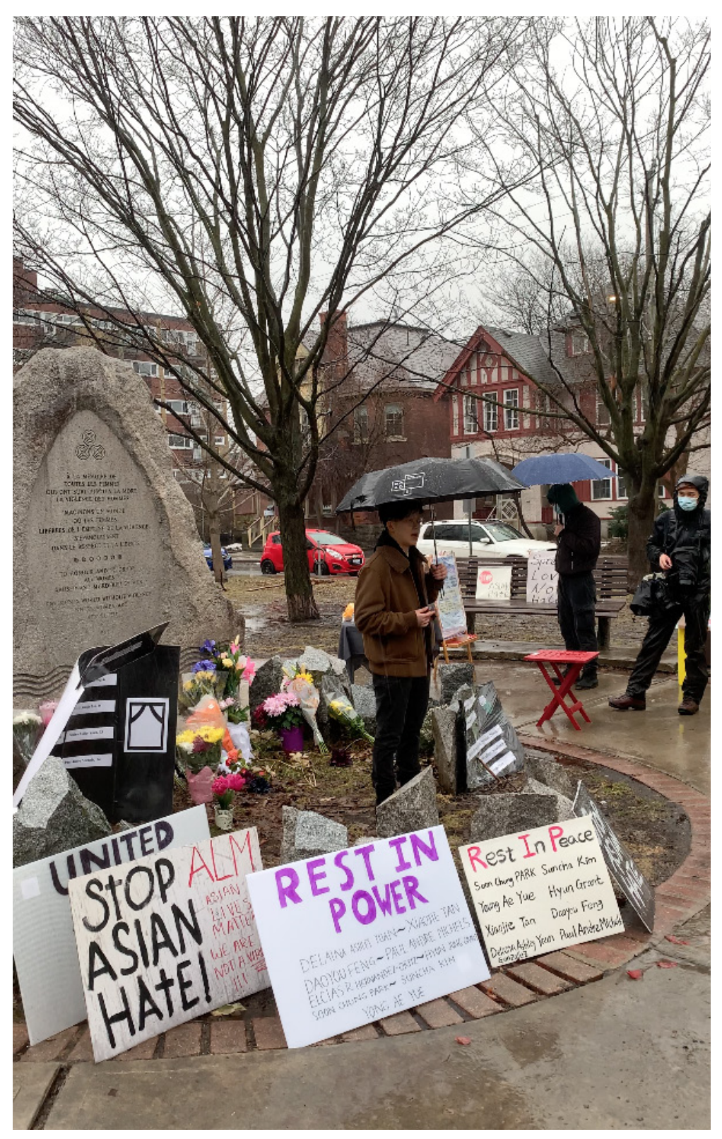
Image 4. An organizer making a speech in front of the Ottawa Women's Monument, March 28, 2021.