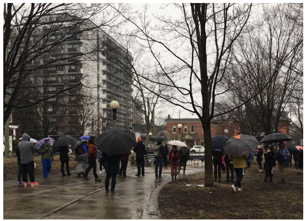
Image 2: Ottawa's Vigil for Atlanta Shooting Victims, March 28, 2021.