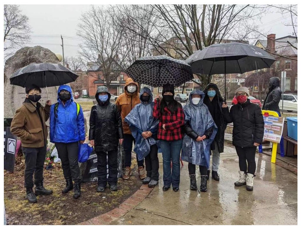
Image 3. Organizers for Ottawa's Vigil for Atlanta Shooting Victims, March 28, 2021.