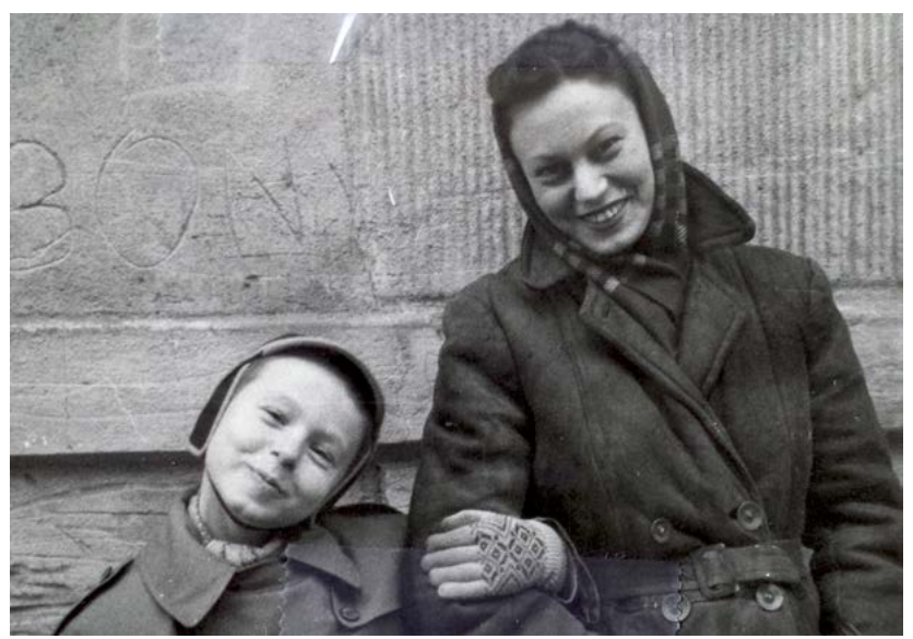
The author with his mother in Hungary 1955