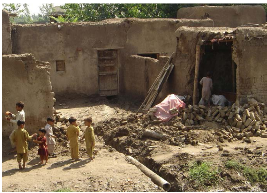
Disrepair in Afghan IDP Camp near Peshawar 2010