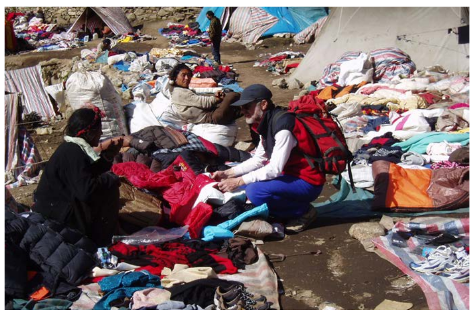
The author chatting with Tibetan traders in 2008

Whilst working in the northern border areas for over a year, I came across many ailing refugees who had, at considerable risk trudged through ice, rocks and snow on bleeding feet and frostbitten extremities to exhaustedly cross the high altitudes to assumed safety. They were lucky; some of their compatriots were arrested and deported by the Nepali military. Others managed to keep travelling to Kathmandu or eventually to Tibetan communities in India. Some recalled fellow refugee aspirants being shot by Chinese border guards. Seeking freedom has costs: leaving families; enduring possible topographic and physical harm en route, as people have little choice but to cross high passes through which altitude and snow conditions can rapidly debilitate them; separating from cherished personal effects; heading into an uncertain future; relentless eternal longing for one's homeland.