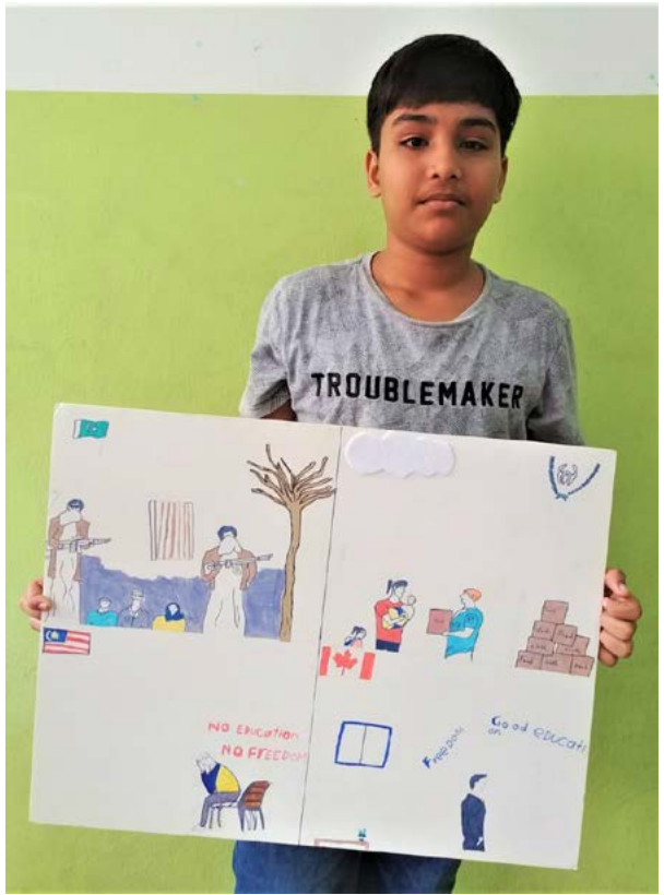
Participant in the Youth Migration Project.