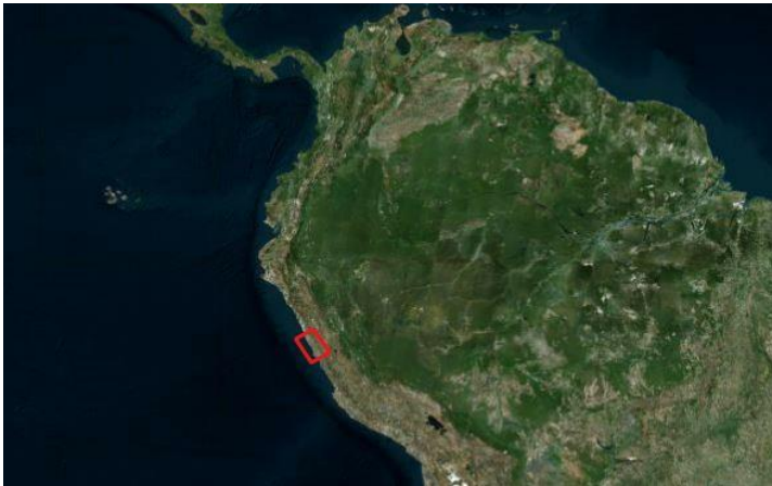
Figure 1: Norte Chico complexes (Bing Maps, referenced Moseley, 1975)

The Peruvian coastline is home to potentially the oldest known civilization in the Americas (Pringle 2001). Norte Chico emerged on the Peruvian coast below the desert foothills of the Andes