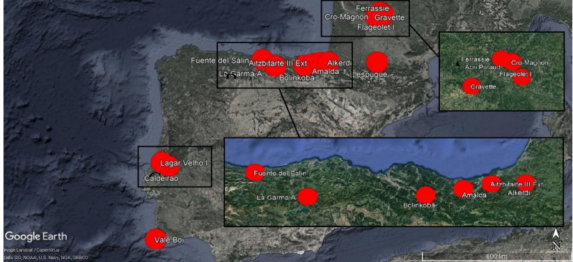
Figure 1: Locations of sites and three regional clusters (A: Dordogne, B: north coast of Spain, C: west coast of Portugal.

The next step was to eliminate any sites that fell outside of my area of study. As previously discussed, ethnographic evidence and studies of raw material procurement during the Paleolithic suggest that the mobility range of hunter-gatherer groups typically does not exceed 300 km. Therefore, I deleted any sites that were 300 km or more from the Atlantic coast. To do this I first created an Excel spreadsheet listing the 162 sites and their coordinates. I then imported this spreadsheet into the open access software Gephi, so that I could convert the file to a .kmz format. Once converted, I was able to import the file into GoogleEarth Pro, which plotted the location of each site.